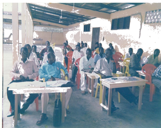
Teacher Training Workshop, 2011

Teachers were trained in skills needed to effectively teach basic reading and writing using the Ghanaian language (L1) Twi and/or Ewe. They were also instructed in how to improve classroom management skills, child centred teaching approaches, moral leadership and moral education approaches including alternative discipline in the classroom. Thirty-five textbooks were supplied to each of the 40 schools in this years programme. The moral education approach intends to integrate the virtues in order that children learn to become better citizens and community leaders in future. Preparation of teaching and learning materials was also a major component of the training workshop inspired teachers to adopt low cost ways to improve teaching practices; many teachers explained that did not remember preparing TLM's since their training college days.